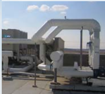
Process cooling application

In many cases the chiller forms part of a complex hydraulic network. MTA offers expert consultancy born from extensive field experience in countless applications, allowing Users to obtain the most from their chilled water network.