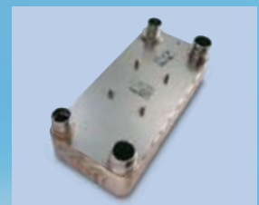
Stainless steel plate exchanger