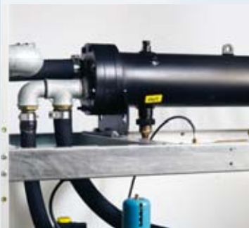
Shell & tube condenser

Water-cooled models offer elevated energy efficiency (EER) levels, and are well suited to hot ambients, or those where indoor installation is required. Noise levels are also reduced notably. (separate document available)