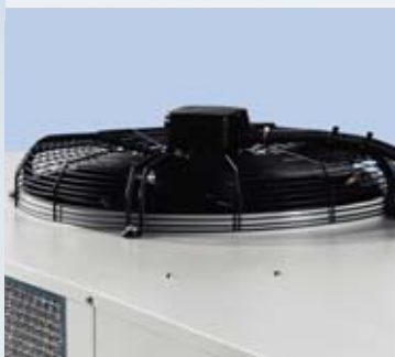
Robust fan section

The most popular solution, with an air-cooled condenser allowing quick and easy installation and high versatility in a multitude of applications. As per the rest of the range, the internal tank and pump offer a fully packaged solution.