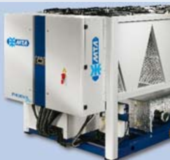
Phoenix Plus chiller

MTA offers industrial air and water-cooled chillers up to 1500kW, with multiscroll, piston, screw or centrifugal compressors. Freecooling units, ideal for industrial applications, are also available. (separate documents available)