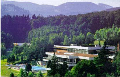
Papiernička - Smolenice - Slovak Republic

Joint conference of IIR Commissions B2 and B1 with E1 and E2