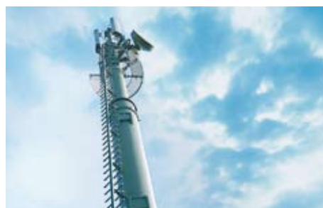
Mobile radio aerial installation