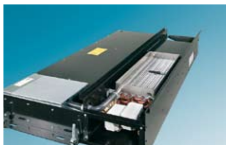
Decentralised air conditioning unit